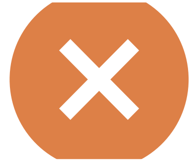
Exemptions for certain projects