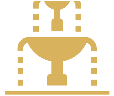
Provision of art on- site