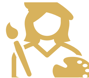
Site & Artist Selection