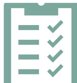
Documentation and Maintenance of Public Art