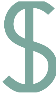
Alternative to Provision of Art