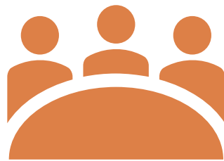
Public Art Review Authority