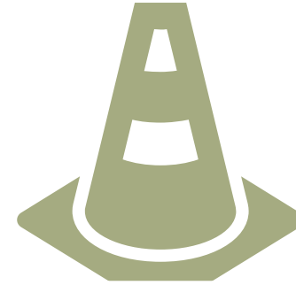
Applicable capital improvement projects