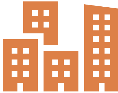
Applicable private development projects