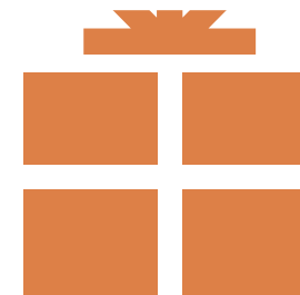
Receipt of Public Art Gifts