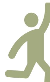
Educational Opportunities and Community Engagement