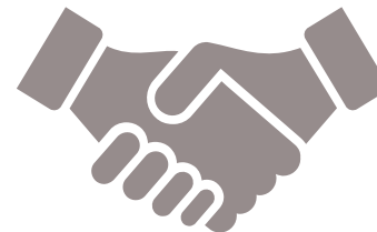
Acquisition and Removal of Public Art